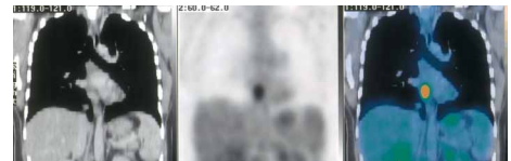
Figure 1b: Fusion of the chest CT and PET coronal imaging shows the abnormal activity in the paraesophageal area.