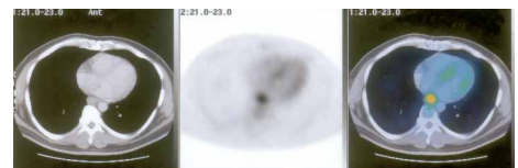
Figure 1a: Fusion of the chest CT and PET transaxial imaging shows an abnormal hypermetabolic focus in the posterior mediastinum.

This 39 year-old man was referred for staging of Hodgkin's lymphoma. A CT scan of the abdomen and pelvis showed a paraduodenal mass and mildly enlarged retroperitoneal lymph nodes. A PET scan showed abnormal activity regional to the paraduodenal mass and retroperitoneal lymph nodes. It also showed abnormal activity involving a paraesophageal mass. This posterior mediastinal mass initially could not be appreciated on the patient's chest CT scan as being separate from the normal esophagus. Thus, the PET scan significantly changed the staging of the patient's disease.